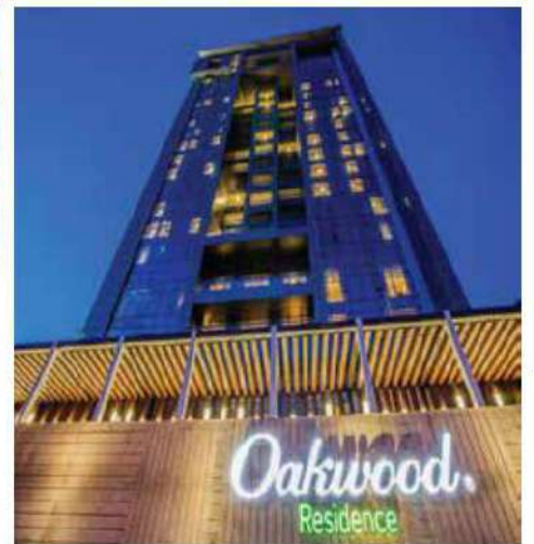
Kapil Towers (Hotel Block) Financial District