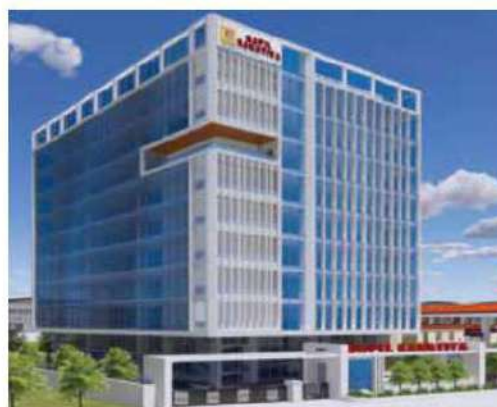
KAPIL KAKATIYA TOWER NAKKALAGUTTA (WARANGAL)