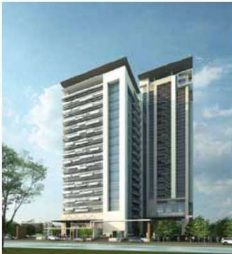
Kapil Towers (IT Block) Financial District